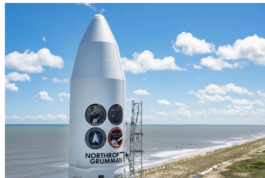
NROL-129 launches out of NASA's Wallops Flight Facility, Virginia, on July 15, 2020.

dedicated launch out of NASA's Wallops Flight Facility in Virginia. NROL-129 carried a classified payload designed, built and operated by the NRO, and it launched aboard a Northrop Grumman Minotaur IV rocket.