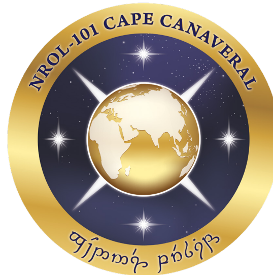
The #NROL101 mission patch pays tribute to the Lord of the Rings stories, with a gold ring and Elvish script that translates to "Goodness Persists".

Space Force Space and Missile Systems Center and the 45th Space Wing. The NRO's next planned launch from CCAFS will be NROL-108 on a Falcon 9 with SpaceX.