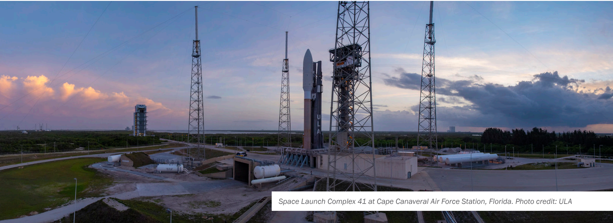
Space Launch Complex 41 at Cape Canaveral Air Force Station, Florida.

crewed flights of the mid-1960s. After the last Titan launch, SLC-41 was renovated to support the Atlas V, with the first ever Atlas V launched from SLC-41 on August 21, 2002. Atlas V rockets are assembled vertically on a mobile launch platform (MLP) in the Vertical Integration Facility located to the south of the pad. The MLP is then transported to the launch pad on rails before launch.