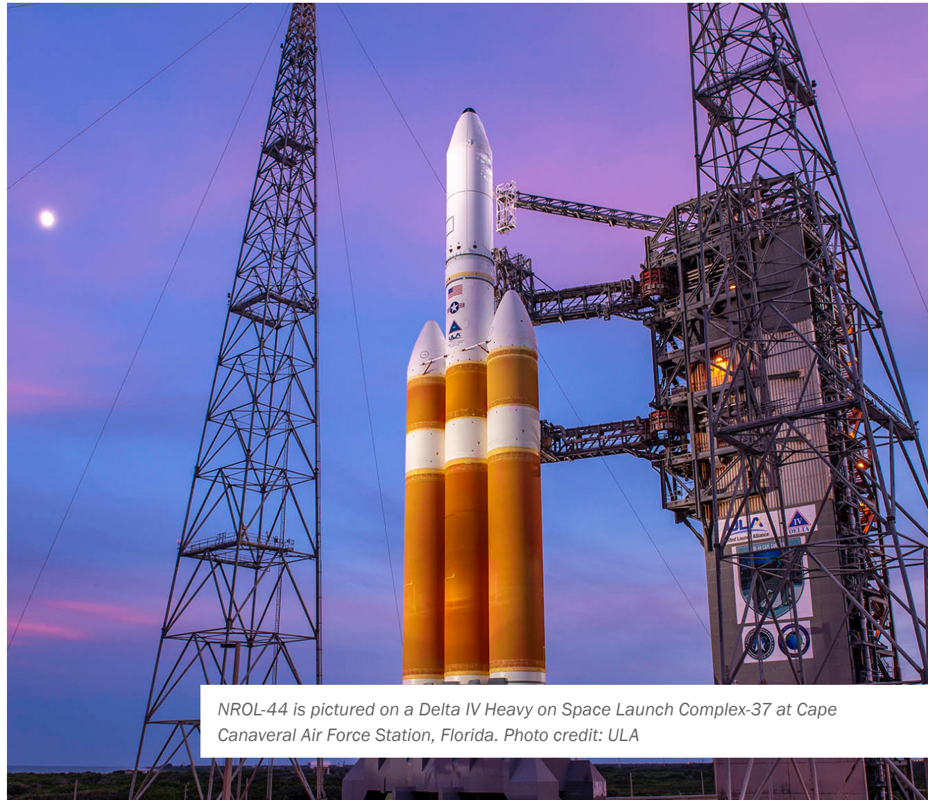
NROL-44 is pictured on a Delta IV Heavy on Space Launch Complex-37 at Cape Canaveral Air Force Station, Florida.

Follow @NatReconOfc on Twitter and Instagram on launch day